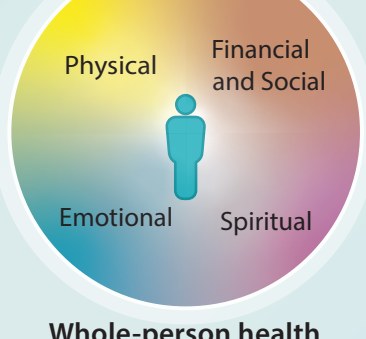
Whole-person health (page 2)