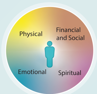
Whole-person health (page 2)